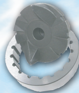
"Radial" Cutter (STANDARD)